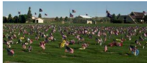
Oregon Trail State Veterans Cemetery Dr. Tom Walsh Memorial Chapel, Aerial view showing the approach road and bridge which leads to the cemetery, and Memorial Day flags

National cemeteries close to Wyoming are: